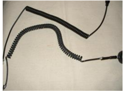
Check the length...