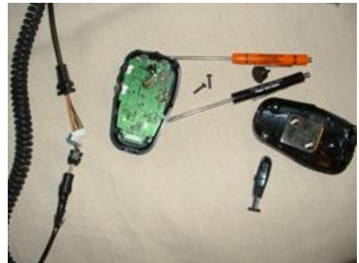
...disassemble the mic...